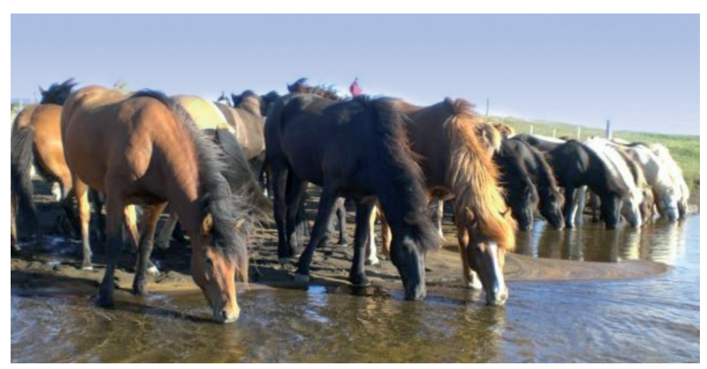
For further information about Nutripferd™ please contact:

This results in less allergy problems (like sweet itch) and stress. Skin and fur become shiny and coating is no longer a problem.