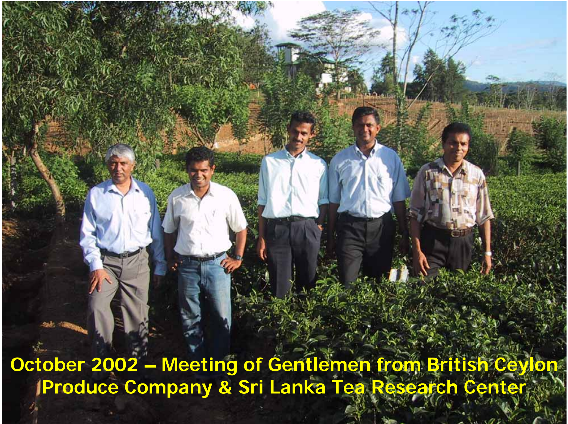
October 2002 – Meeting of Gentlemen from British Ceylon Produce Company & Sri Lanka Tea Research Center